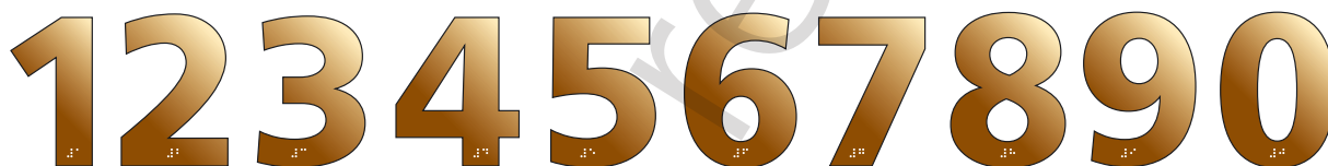
LIT 100 LP 1, 2, 3, 4, 5, ...