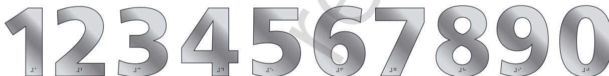
LIT 100 SS 1, 2, 3, 4, 5, ...