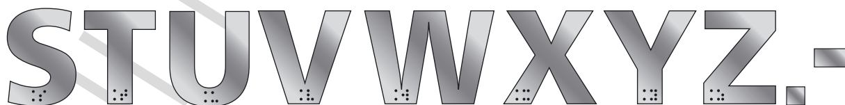
LIT 50 SS A, B, C, D, ...