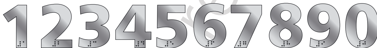
LIT 50 SS 1, 2, 3, 4, 5, ...